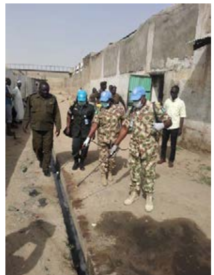
Fumigation to the Nyala Prison Premises