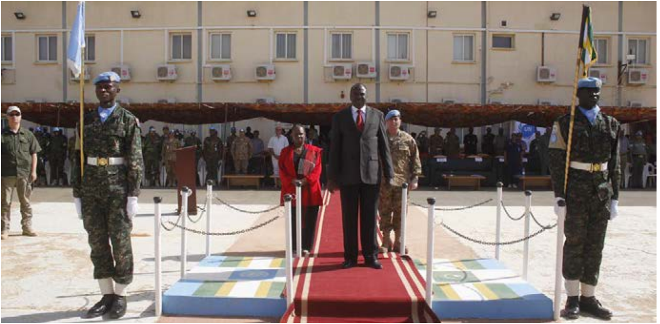
The Wali of North Darfur and the Minister of Culture and Environment – North Darfur State, Mr Hamza Abassi, receiving salute from Gambia Guard of Honour during the UN Peacekeeping Day, on 29th May 2017, at FHQ-El Fasher.

On 29 May 2016, the African Union-United Nations Hybrid Operation in Darfur (UNAMID) commemorated the yearly United Nations Peacekeepers' Day. The Celebration was attended by the Wali of North Darfur and the Minister of Culture and Environment – North Darfur State, Mr Hamza Abassi, Acting UNAMID Force Commander, Maj Gen Fida Hussain Malik, Police Commissioner- Madam Priscilla Makotose, and other official dignitaries.