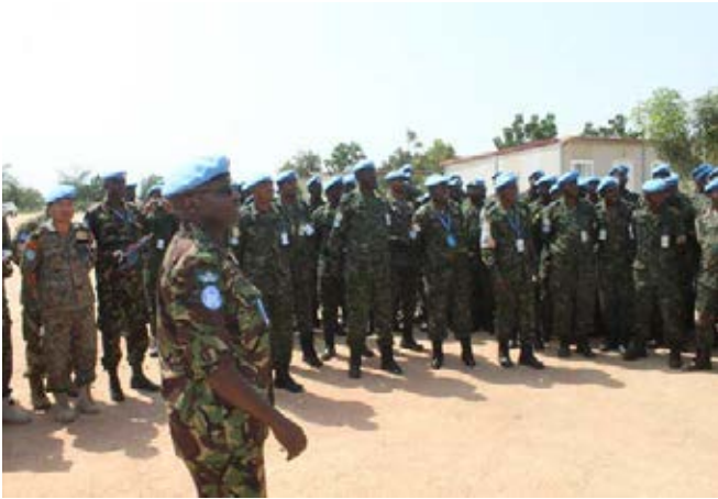
UNAMID Force Commander , Lieutenant General Leonard Muriuki Ngondi share a light moment with RWANDBATTS 48 during his Operational Visit at NERTITI Team Site on 30 September 2017.