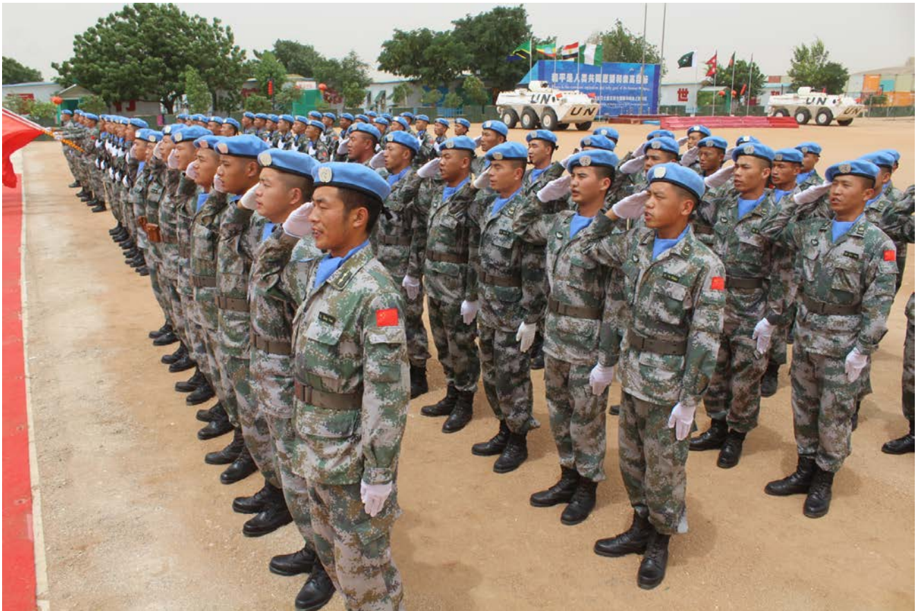
CHENGCOY 13 Members saluting while the AU / UN anthem was played.