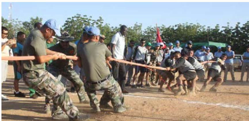
We must win.

Recently, the Military Welfare in conjunction with the Staff Counselling and Welfare Unit organized welfare/sporting activities to mark Year 2017 United Nations Day Celebration.