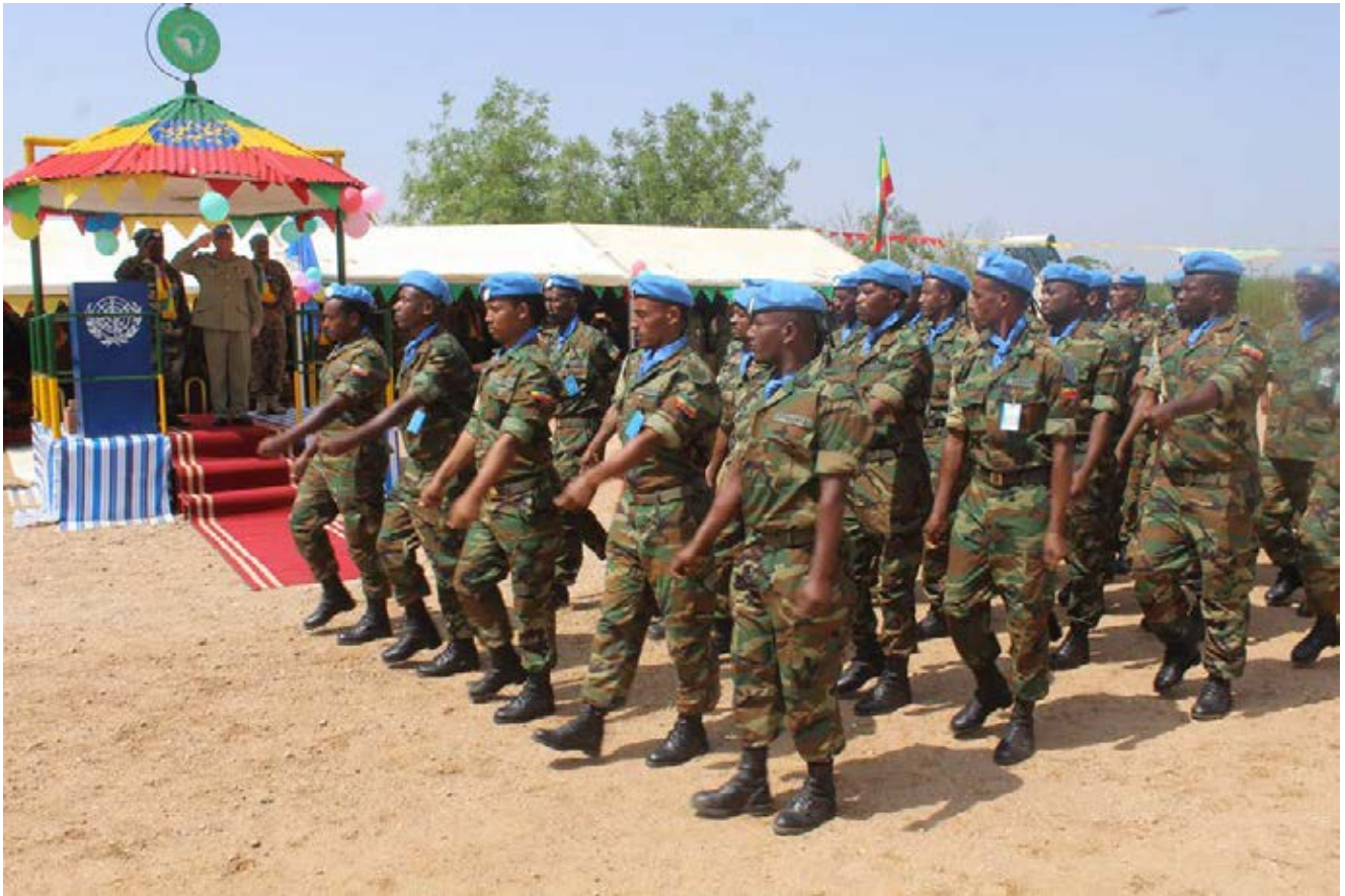
ETHBATT-19 soldiers marching while passing the saluting dice. Photo by UNAMID Military Public Information Section.