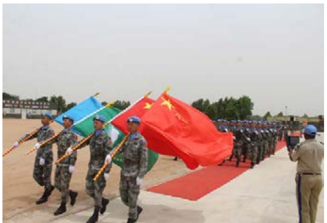
CHENGCOY 13 marching out from Parade Ground.