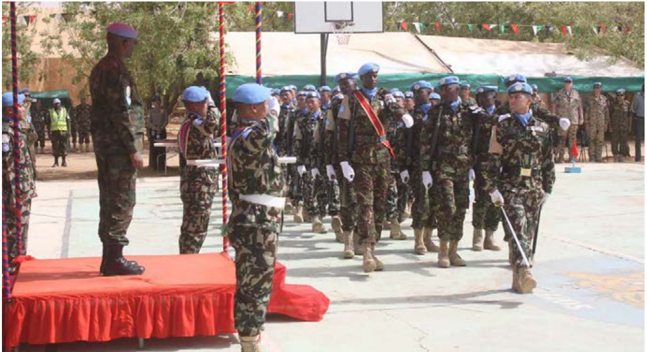
The outgoing UNAMID Force Commander, Lieutenant General Frank Kamanzi, looking at the parade marching, during joint Kenyan and Nepalese contingents medal ceremony on 6 April, 2017 at Nepalese Ground Parade-FHQ, El Fasher.

A United Nations Peace Keeping Medal Parade is one of the most anticipated events for uniformed personnel in the Mission's operation area. Medal decoration serves as the ultimate recognition of a peacekeeper's dedication and sacrifice during one's deployment in a foreign land.