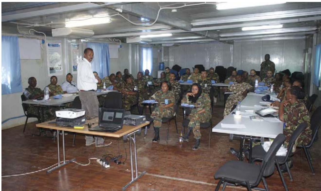
The participants of gender training course conducted on 23-25 Oct 2017 at IMTC, El Fasher, North Darfur.

Gender mainstreaming was established as a major global strategy for the promotion of gender equality in the Beijing Platform for Action from the Fourth United Nations World Conference on Women in Beijing in 1995.