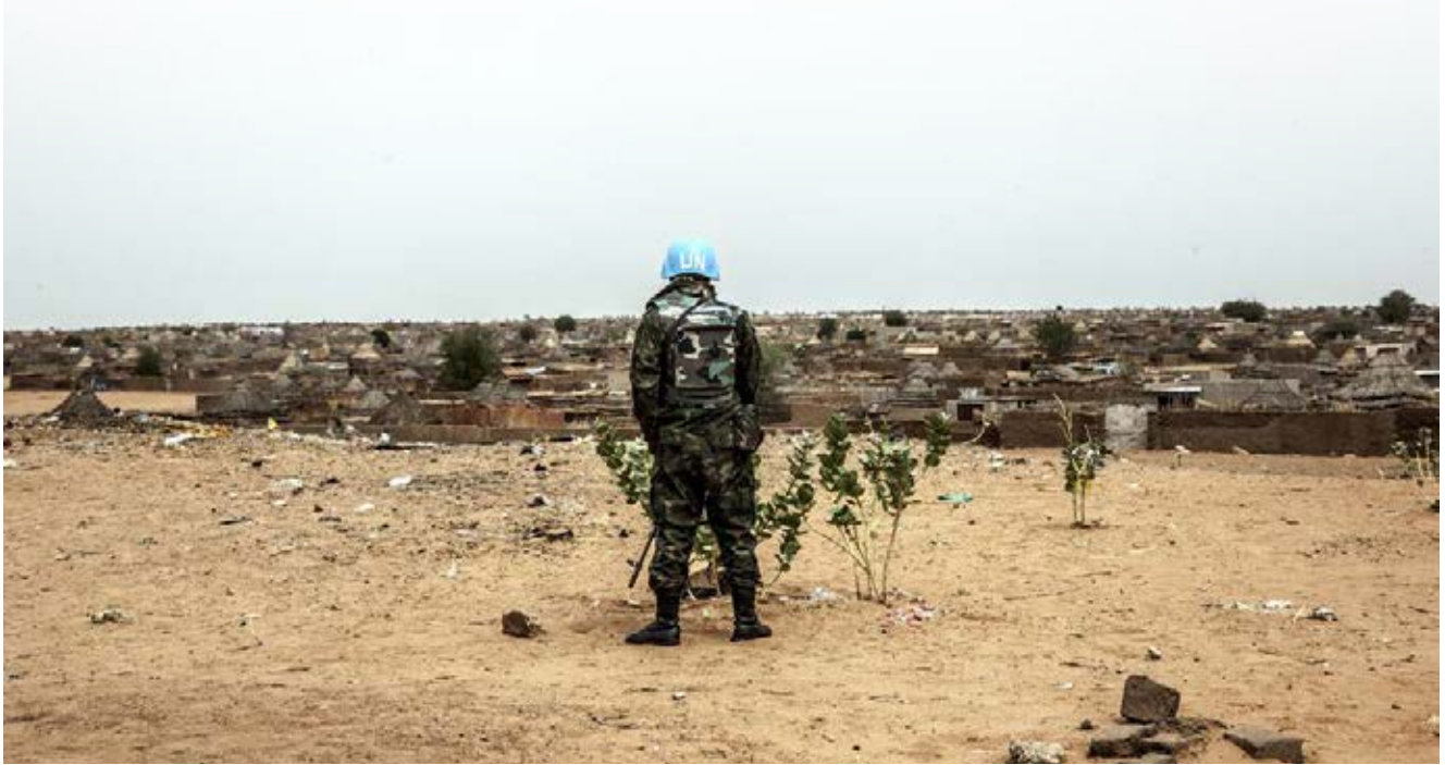
UNAMID Military securitized Abushouk IDPs Camp, El Fasher, North Darfur.

The Security Council adopted Resolution 2363 (2017) which renewed the mandate of the African Union-United Nations Hybrid Operation in Darfur (UNAMID) until 30 June 2018, while deciding to draw down the mission's troop and police strength over the next one year. The Protection of Civilians is one of the renewed core mandates of UNAMID.