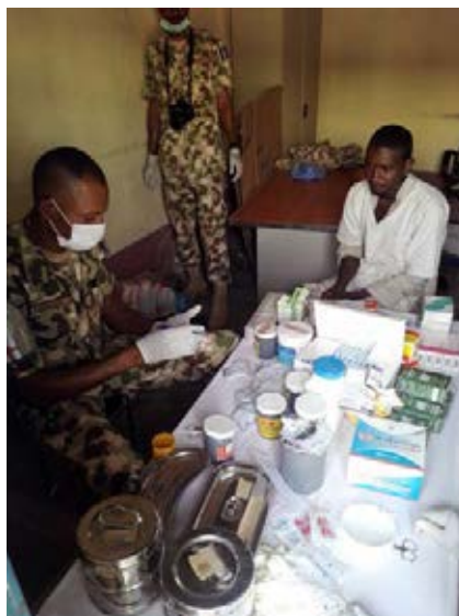
Medical Service to Civilians.

A UNAMID NIBATT 46 provides dental and Fumigation services as part of a free medical outreach campaign that targeted some 150 inmates and officials at a Prison in Nyala, South Darfur. The initiative is part of the Mission's ongoing efforts to promote health services across Darfur.