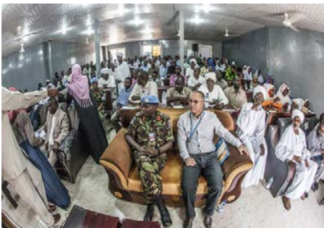
UNAMID Force Commander Lieutenant General Leonard Muriuki Ngondi attended as guest of honour to the photo exhibition and debate in Omdurman Islamic University, El Fasher, North Darfur on 25 September 2017 during International Peace Day.