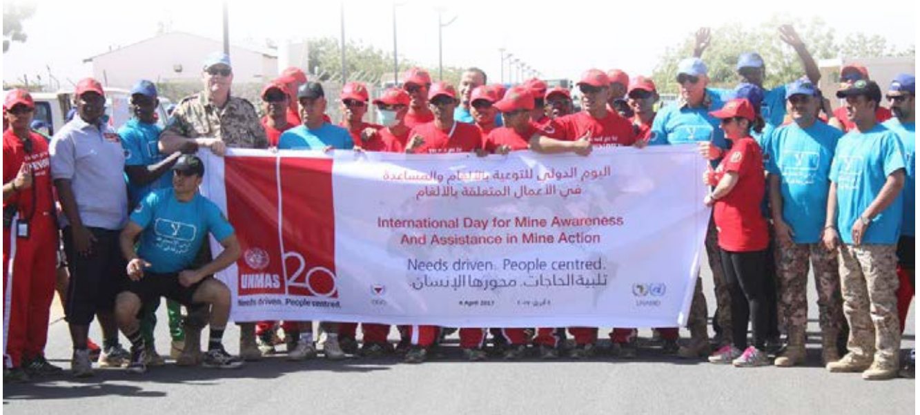
Participants of 20th anniversary for International Day for Mine Awareness and Assistance in Mine Action marking the celebration of UNMAS on 30 March 2017.

UNAMID Ordnance Disposal Office (ODO) organized a series of events to commemorate the International Day of Mine Awareness and Mine Action Assistance, observed annually by the UN and partners across the globe on 4th of April every year. The colourful event, which took place at the Mission's Headquarters in El Fasher, North Darfur, brought together about two hundred participants from the five states of Darfur to participate in the "Fun Run".