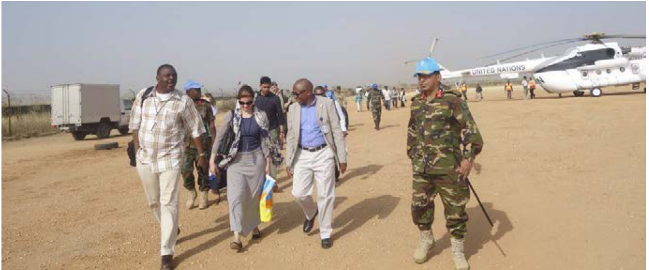
On 15 March 2017, a Strategic Review Mission on UNAMID concluded a one-week visit to Darfur. The team, composed of representatives of the United Nations and the African Union, visited all five Darfur states, meeting Government officials, internally displaced persons and the Mission leadership. In the photo, the team arrives in Zalingei, Central Darfur.