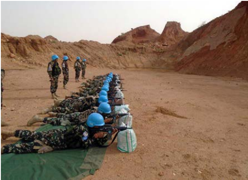
Nepalese Force Reserve Company (NEPFR-CXII) conducting Live Firing Exercise in GoS Military 6 Division Firing range.

Operational readiness of any force is gauged through the level of training being conducted. In UN's environment, different countries participate with various levels of operational readiness. Therefore, conduct of multinational operations within