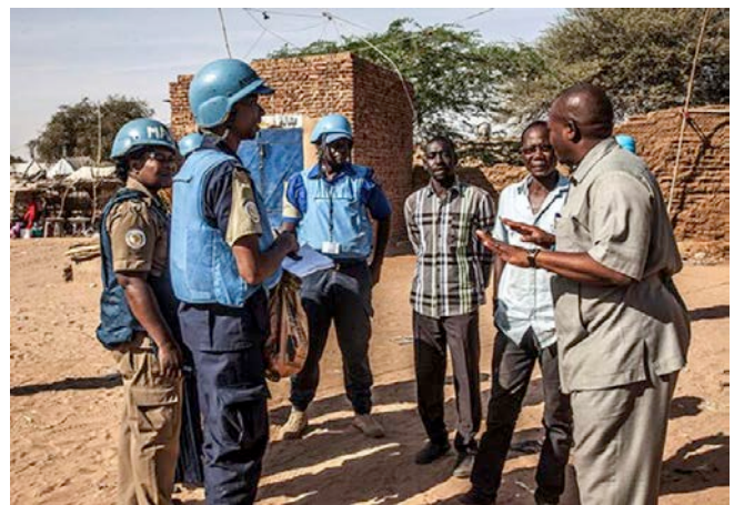
UNAMID peacekeepers interact with members of the local population during a patrol at Zam Zam camp for internally displaced persons, near El Fasher, North Darfur. As part of its protection of civilians mandate, the Mission operates daily patrols – numbering in the hundreds each week – that cover camps and villages across Darfur.