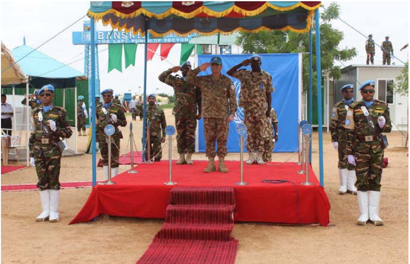
UNAMID Deputy Force Commander, Maj Gen Fida Hussain Malik salutes while the AU - UN national Anthem was played during the medal ceremony held at Nyala SC, South Darfur On 19 Oct 17.