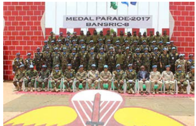
A group photo of BANSRIC-8 members with UNAMID Deputy Force Commander, Maj Gen Fida Hussain Malik during the medal ceremony held at Nyala SC, South Darfur On 19 Oct 17.